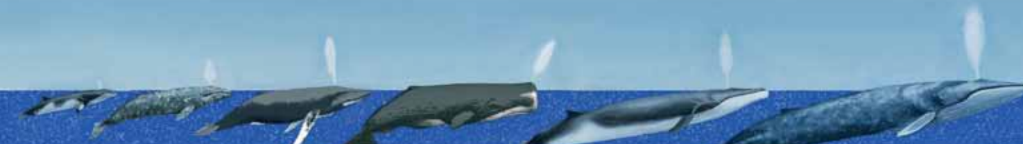
Minke (30') Gray (45') Humpback (50') Sperm (60') Fin (90') Blue (100')

Whale Watching takes place almost all year ’round on the Oregon coast. Peak Winter Watch is the last week of December and the first week of January. Spring Watch begins the last week of March and lasts through June. Summer Watch runs June through mid-November, when whales are best seen in the central coast area. Whales come close to the shore, diving, feeding and rubbing against the rocks. Whales are rarely seen mid-November to mid-December or mid-January to mid-March.