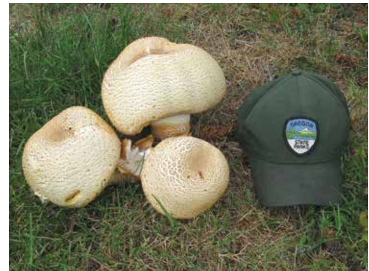
Prince (Agaricus augustus)

The Prince is considered to be a delicious edible. Identified by its golden cap and almond-like smell, the Prince can be found from late summer through fall. They are rare, and if you are lucky enough to find a patch, you are in for a treat.