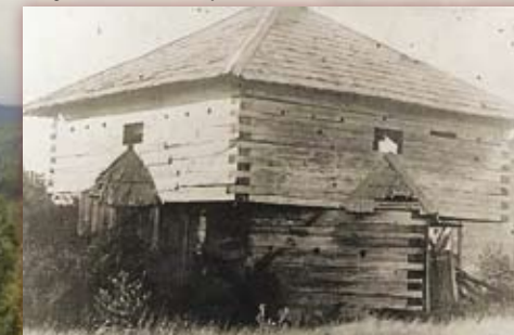
Fort Yamhill Blockhouse after it was moved to Grand Ronde, Oregon.