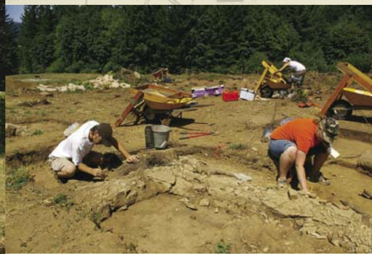
Student archaeologists unearth the foundation of a fort building.