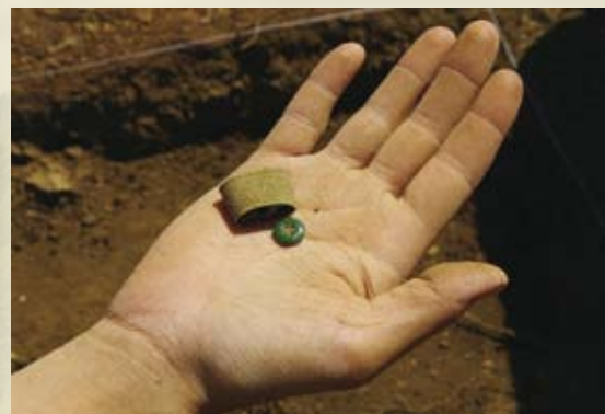
Relics of daily life.