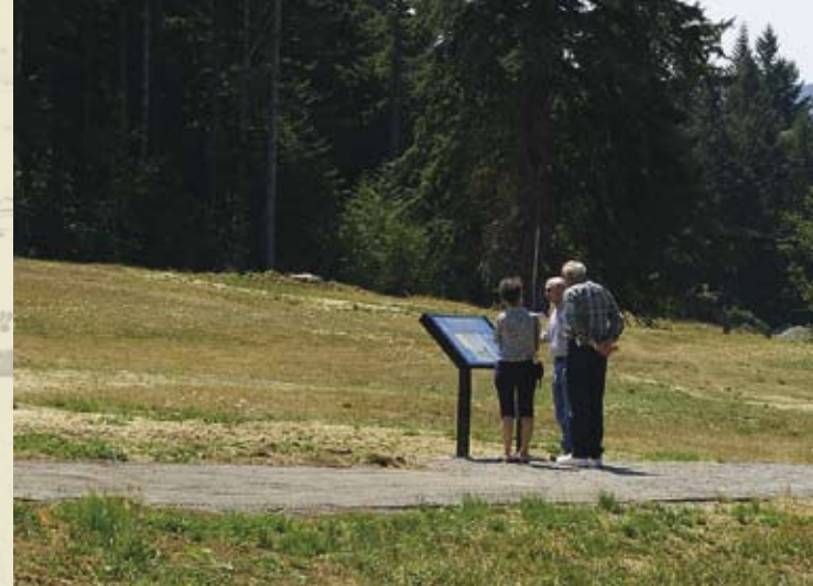
Panels placed along the trail share glimpses of fort life.